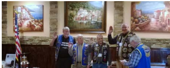
Swearing in of 2014 USS Virginia Base officers at January 9, 2014 meeting